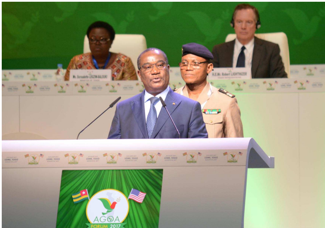
H.E. Mr. Komi Sélom KLASSOU, Prime Minister, Head of Togolese Government, Opening Speech