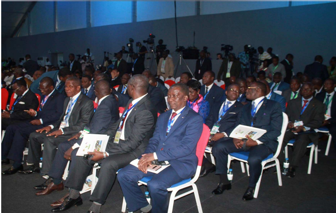
Partial view, Togolese Government Members