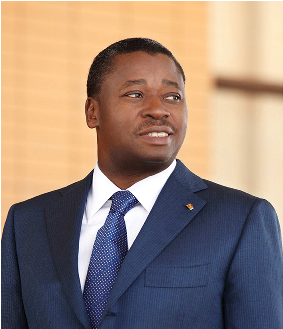
His Excellency Mr. Faure Essozimna GNASSINGBE Togolese Head of State